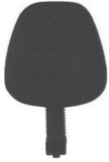
Back with bellow