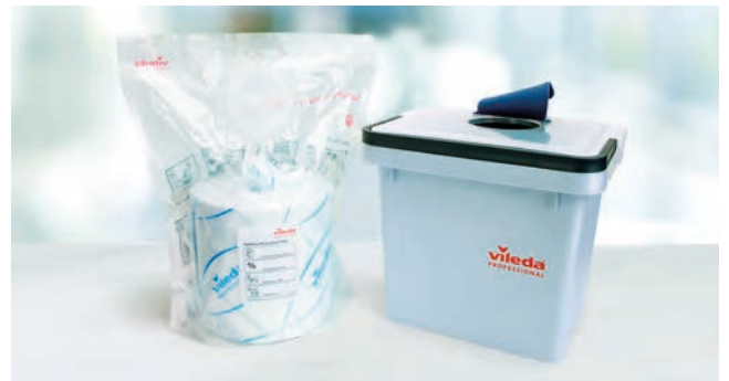
SafePlus MicronRoll Maxi + SafePlus Dispenser Maxi